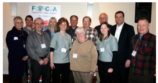
FOCA Board and Staff, March 2011

The event was recorded; if you couldn't attend, contact the office for instructions to access the digital archive of the day's presentations (see over) & discussions.