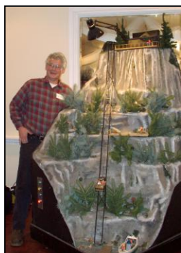
John of Inclined Elevation

To view the individual slide presentations digitally, click here . If you attended but didn’t complete the event survey, please click here to submit an online version.