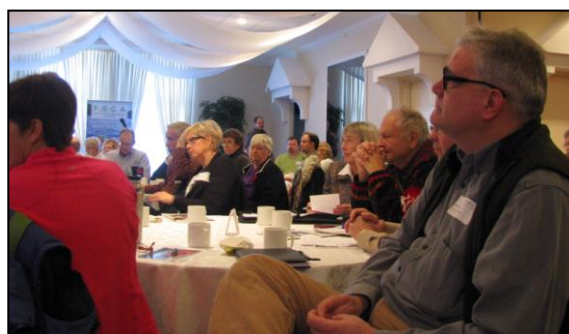
Listening to the presentations