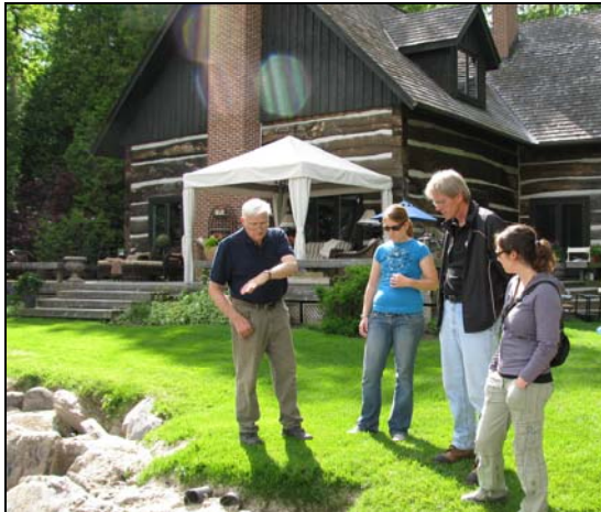
Lakeshore resident discusses shoreline concerns with program staff.