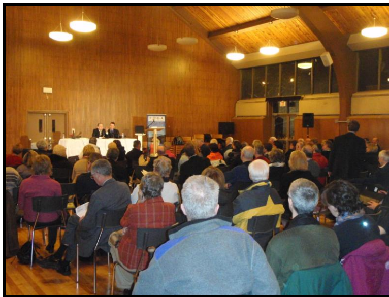
Over 160 people crowded into the WRAFT/CAPTR/FOCA meeting with MPAC on January 28 in Toronto

The event was organized to provide an opportunity to get answers to questions about the recent property assessment, to discuss changes at MPAC and with the assessment process. The meeting was a response to the flood of questions and concerns about shifting property assessments, and was timed to allow interested property owners to meet the deadline for filing 'Requests for Reconsideration' which is March 31, 2009 .